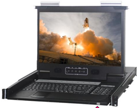
(USB Port for device access)

Optimize rack space. Maximize rack monitoring